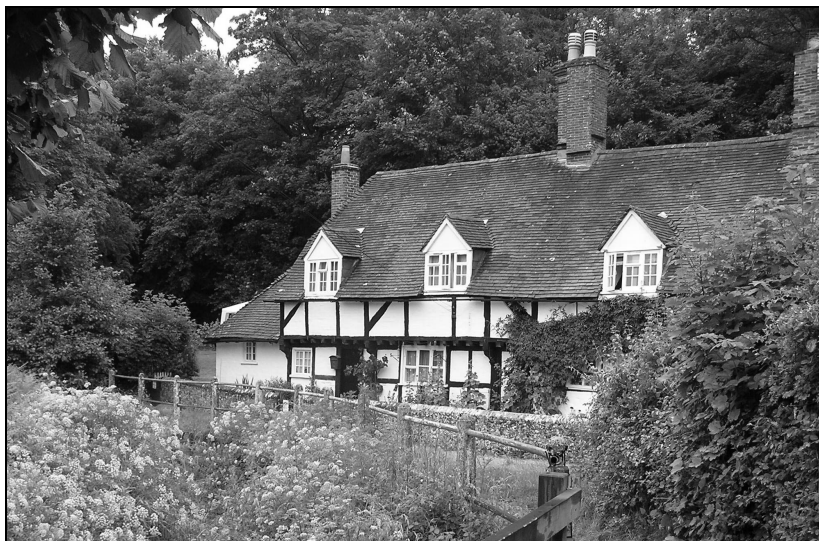
Houses by the stream near to The Harrow, Steep